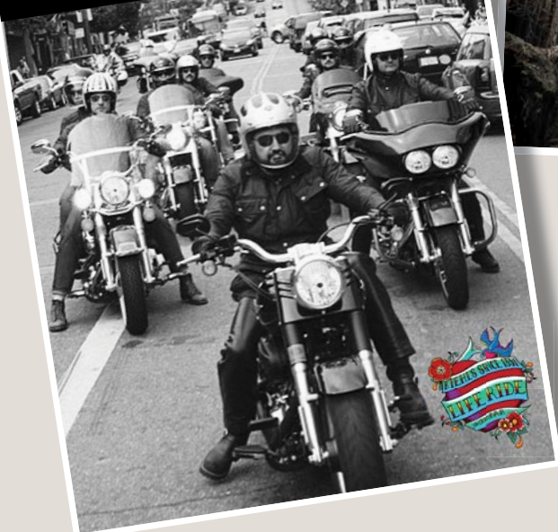
The 2013 crew rides through the streets of the Castro in San Francisco, CA.