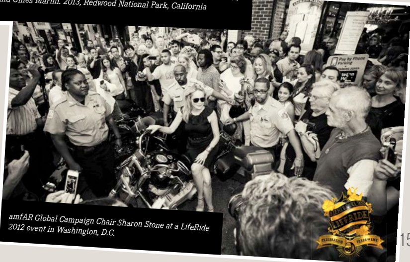
amfAR Global Campaign Chair Sharon Stone at a LifeRide 2012 event in Washington, D.C.