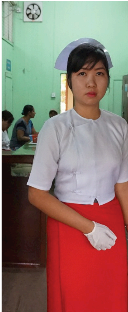
A nurse at the Myanmar Ministry of Health's AIDS/STD Prevention and Control Programme

An amfAR research project is on the front lines of Myanmar's evolving HIV response