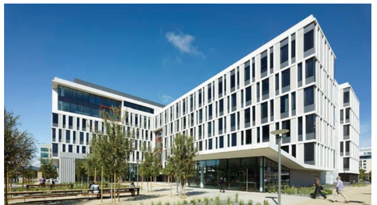
The amfAR Institute will be based at UCSF’s Mission Bay campus.